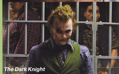
The Dark Knight