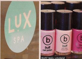
BUFF NAIL LOUNGE