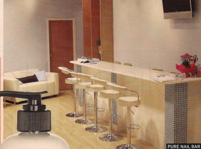
PURE NAIL BAR